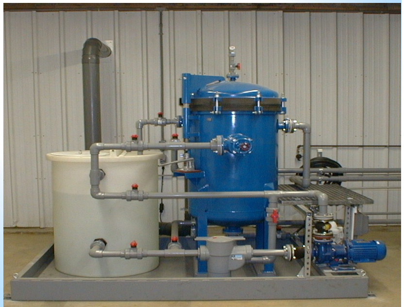
Closed loop filtration system for continuous removal of solids from a sulfuric acid pickle tank. The system tripled the usable life of the H 2 SO 4 pickle bath with 50% reduction in acid usage and waste.