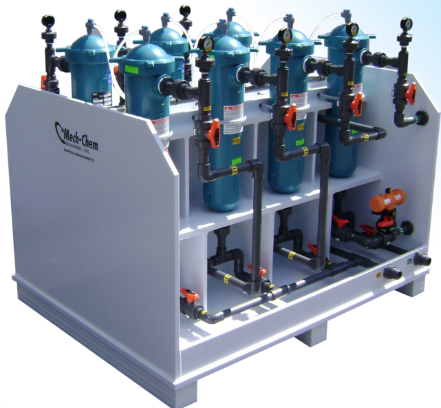
Acid filtration system for removal of fine particulates. System has parallel filtration trains to pre-filter various acid and chemical solutions before usage in solids sensitive equipment.